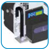
HIGH PRECISION SAFE