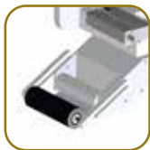
HIGH PRECISION RIGID