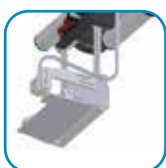
MINI EASY JET